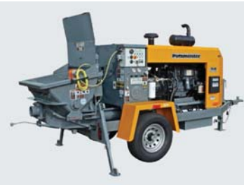
Thom-Katt Series — Tier 3