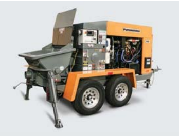
Thom-Katt Series — Tier 4