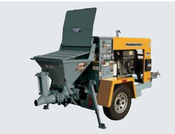
TKB Series Hydraulic Ball Valve Pumps